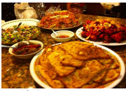
Figure 3 food