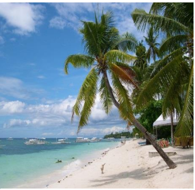
Figure 1 at the beach

Day 2 : After we got back we went to the pool and I did some